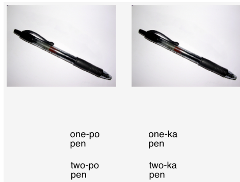
Figure 1: Example trial